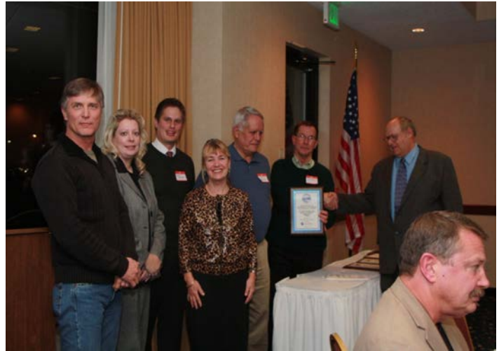
Excellence in Hazardous Materials Management SY Transfer Lines Replacement Project